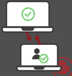
Passwordless login Remote PC