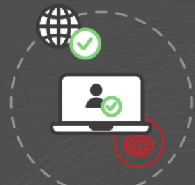
Biometric login intranet web services

Enhance your company Security & Productivity